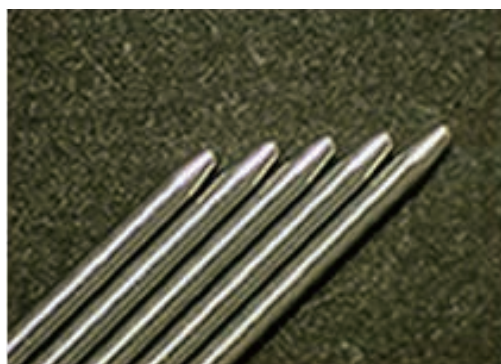
\phi 0.7 \cdot \theta 15^\circ \cdot 250\mu R