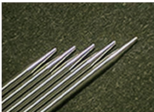
\phi 0.7 \cdot \theta 10^\circ \cdot 150\mu R