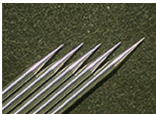
\phi 0.7 \cdot \theta 15^\circ \cdot 15\mu R

We allow you to specify customized materials, diameters ( \phi D ), angles ( \theta ), lengths ( L ), tip radius, and shape (Detail Z).