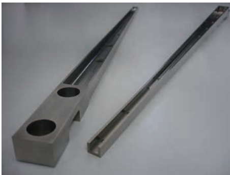
Parts for Semiconductor Wafer Processing Equipment